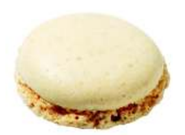
Plain Ø 35 mm et Ø 69 mm