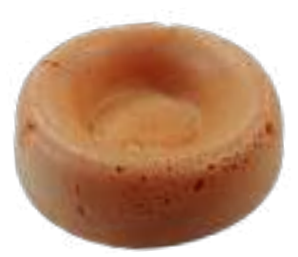
Restauration Ø 90 mm