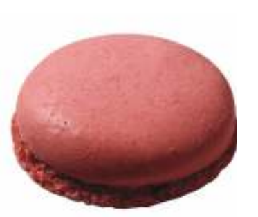
Chocolate Ø 35 mm et Ø 69 mm