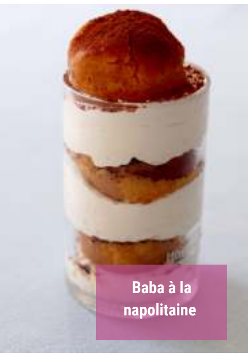
Find these recipes and many more on