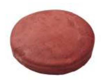
Cocoa Ø 32 cm