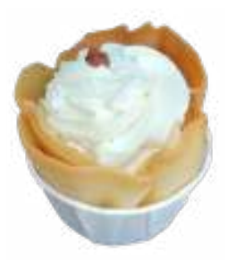
To fill with cream, mousse, ice cream or fruit.

Without preservatives and coloring agents