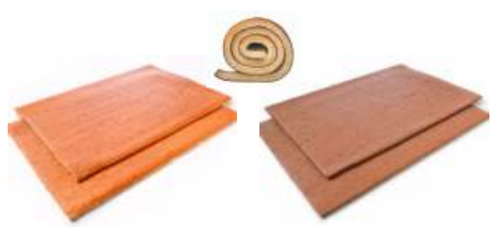
Sheet 7 mm plain 58 cm x 37 cm