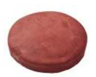
Cocoa Ø 28 cm