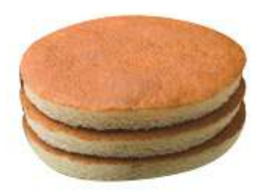
Sponge cake disc