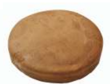
Plain Ø 32 cm