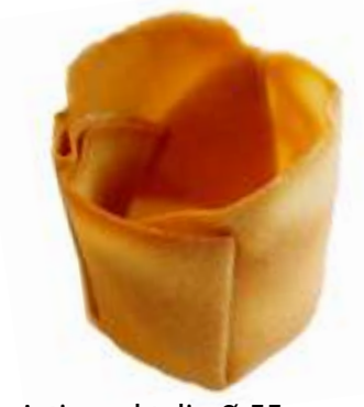
Artisanal tulip Ø 55 mm