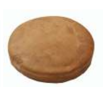
Plain Ø 28 cm