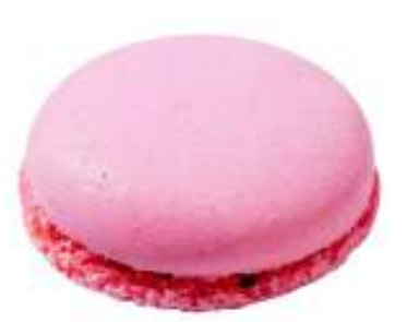
Raspberry Ø 35 mm et Ø 69 mm